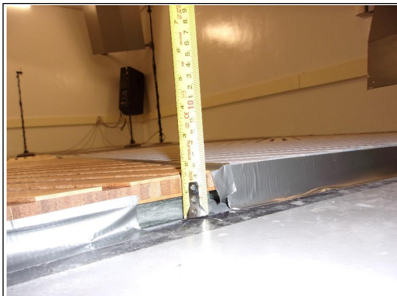
Photo No. 2 Cross Section view of Product